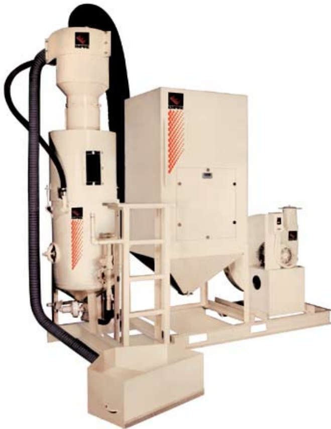
PRS system offers an economical alternative to a full blast room for limited-use operators. In addition to pneumatically collecting media, the unit recycles and cleans abrasives through a cyclonic reclaimer attached to a media-filtration system.

With Empire, you can select the system that's right for you and be confident we'll help you make the best choice. Plus, we offer the option of turnkey installation backed by the best warranty in the industry.